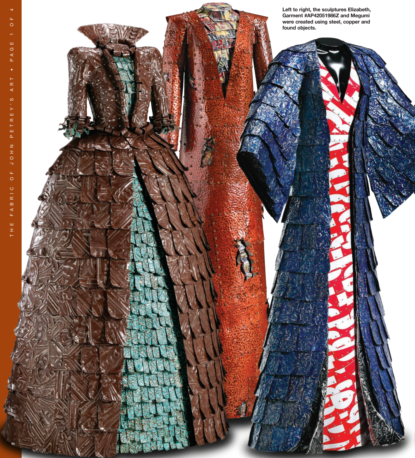
Left to right, the sculptures Elizabeth, Garment #AP42051986Z and Megumi were created using steel, copper and found objects.